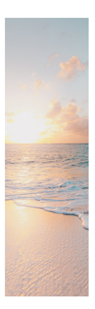
A Home Pilgrimage